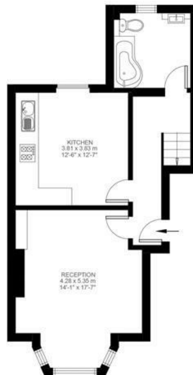
Raised Ground Floor